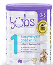
Bubs Easy Digest Goat Milk Stage 1 *800 g (28.2 oz.)