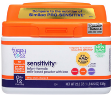
Tippy Toes Sensitivity, Plus, & Premium 22.5 oz. *33.2 oz.