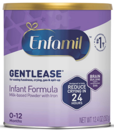
Enfamil Gentlease 12.4 oz 19.9 oz. *27.7 oz.