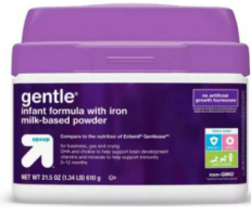
Up & Up Gentle 21.5 oz. *33.2 oz.