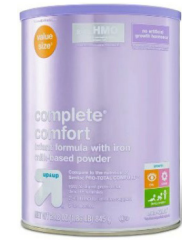
Up & Up Complete Comfort *29.8 oz.