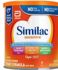
Similac Sensitive 12.5 oz.