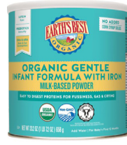
Earth's Best Organic Gentle 21 oz.