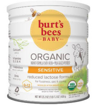
Burt's Bees Baby Organic Sensitive 23.2 oz. *34 oz.