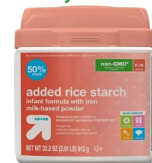
Up & Up Added Rice Starch *32.2 oz.