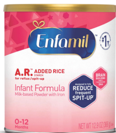
Enfamil A.R. 12.9 oz. 19.5 oz. *27.4 oz. *30.4 oz.