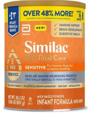
Similac 360 Total Care Sensitive 20.1 oz. *29.5 oz. *30.2 oz.