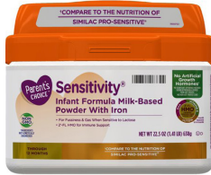
Parent's Choice Sensitivity & Sensitivity Premium 12 oz. 22.5 oz. *34 oz.