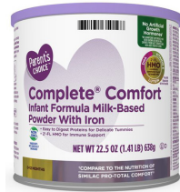
Parent's Choice Complete Comfort 22.5 oz. *29.8 oz.