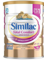
Similac Total Comfort Stage 1 *28.9 oz.