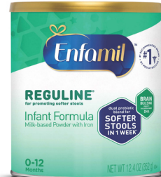
Enfamil Reguline 12.4 oz. 19.5 oz.