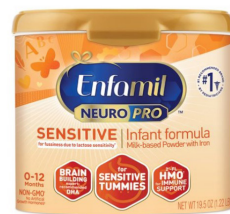
Enfamil NeuroPro Sensitive 19.5 oz.