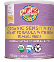
Earth's Best Organic Sensitivity 21 oz. *32 oz.