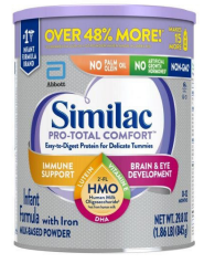
Similac Pro-Total Comfort *29.8 oz.