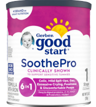
Gerber Good Start SoothePro 12.4 oz 19.4 oz. *30.6 oz.