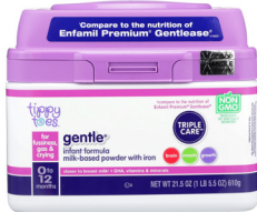
Tippy Toes Gentle 21.5 oz. *33.2 oz.