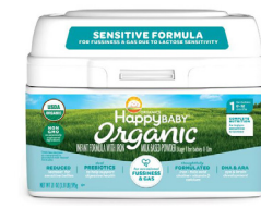
Happy Baby Organic Sensitive Stage 1 21 oz.