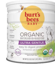
Burt's Bees Baby Organic Ultra Gentle 23.2 oz. *34 oz.