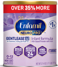
Enfamil NeuroPro Gentlease 19.5 oz. *27.4 oz. *30.4 oz. *35.2 oz.