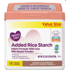
Parent's Choice Added Rice Starch 21.5 oz *32.2 oz.