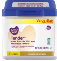
Parent's Choice Tender *32 oz.