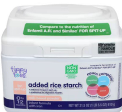
Tippy Toes Added Rice Starch 21.5 oz.