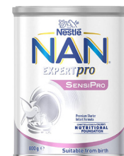
NAN EXPERTpro SensiPro *800 g (28.2 oz.)