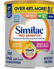
Similac Pro-Sensitive *29.8 oz.