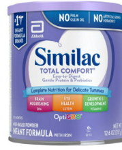
Similac Total Comfort 12.6 oz.