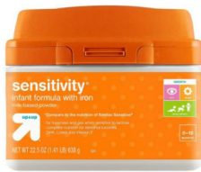
Up & Up Sensitivity & Sensitivity Premium 22.5 oz. *33.2 oz.